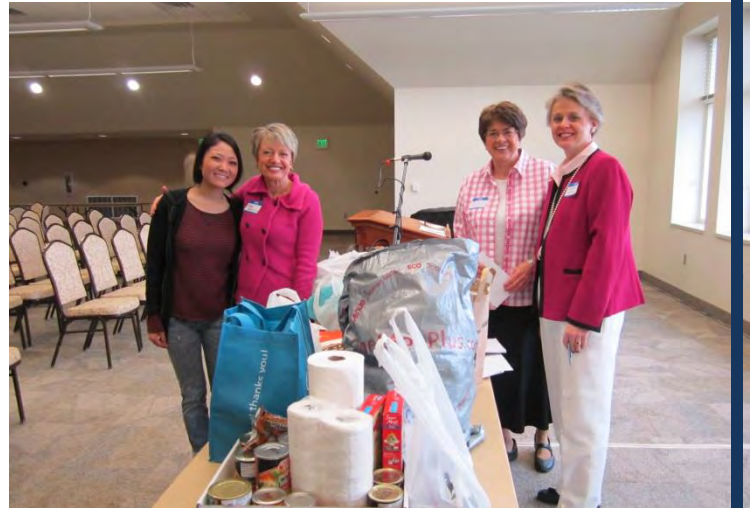
Spring 2012 Service Project

Please bring your donations to either of our Fall meetings: September 27 or December 4. Below are some suggestions, but donations of other items or cash donations will also be greatly appreciated.